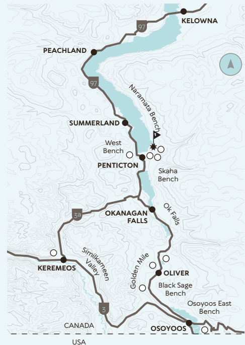
OKANAGAN VALLEY AND SIMILKAMEEN VALLEY